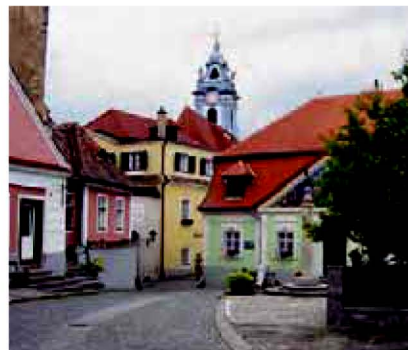
✦ Dürnstein's cobble streets