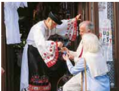
✦ Shopping in Budapest

A quick stroll from the dock in Budapest takes you to one of the city's best marketplaces—the Great Market Hall, established in 1897. A variety of shopping stalls await you—supermarket and fishmongers in the basement, greengrocers and spice vendors on street level, and fine linens, knickknacks and delicious Hungarian treats like sausages and sweet pancakes on the floor above. A must-see.